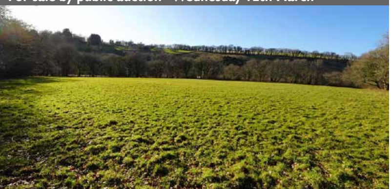
Approximately 3.49 acres of pasture land in a single gently sloping enclosure with parish road frontage.

Tavistock | Auction Guide Price £45,000 - £50,000 For sale by public auction - Wednesday 12th March